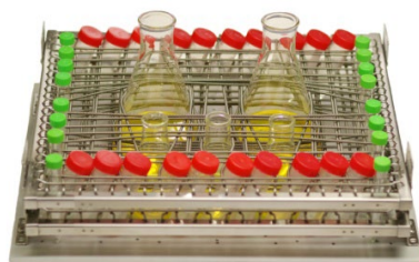
Full Size Spring Rack